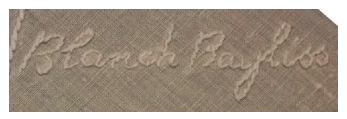
Blanch Bayliss signature on quilt