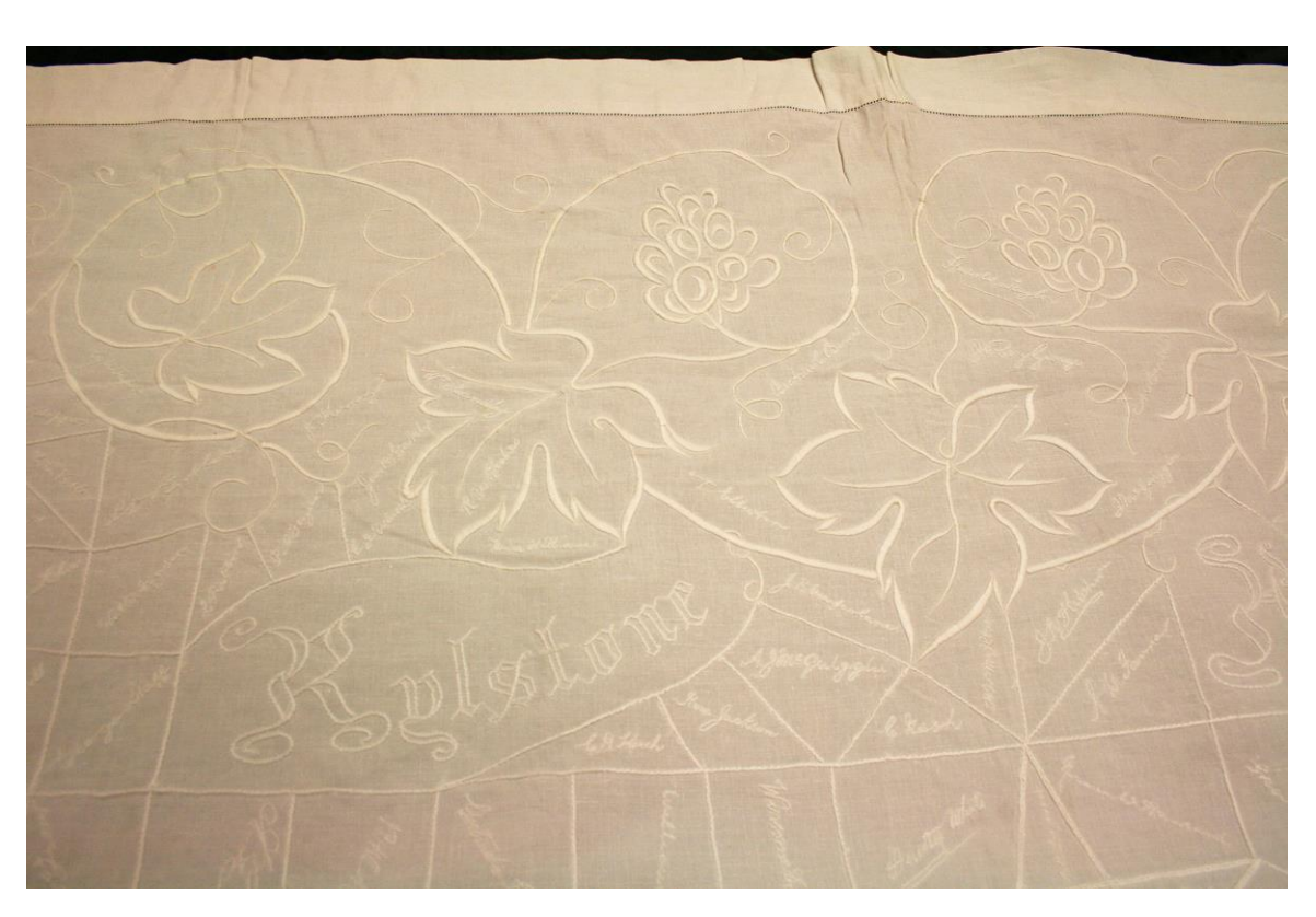
Rylstone and Grape Vines (detail)