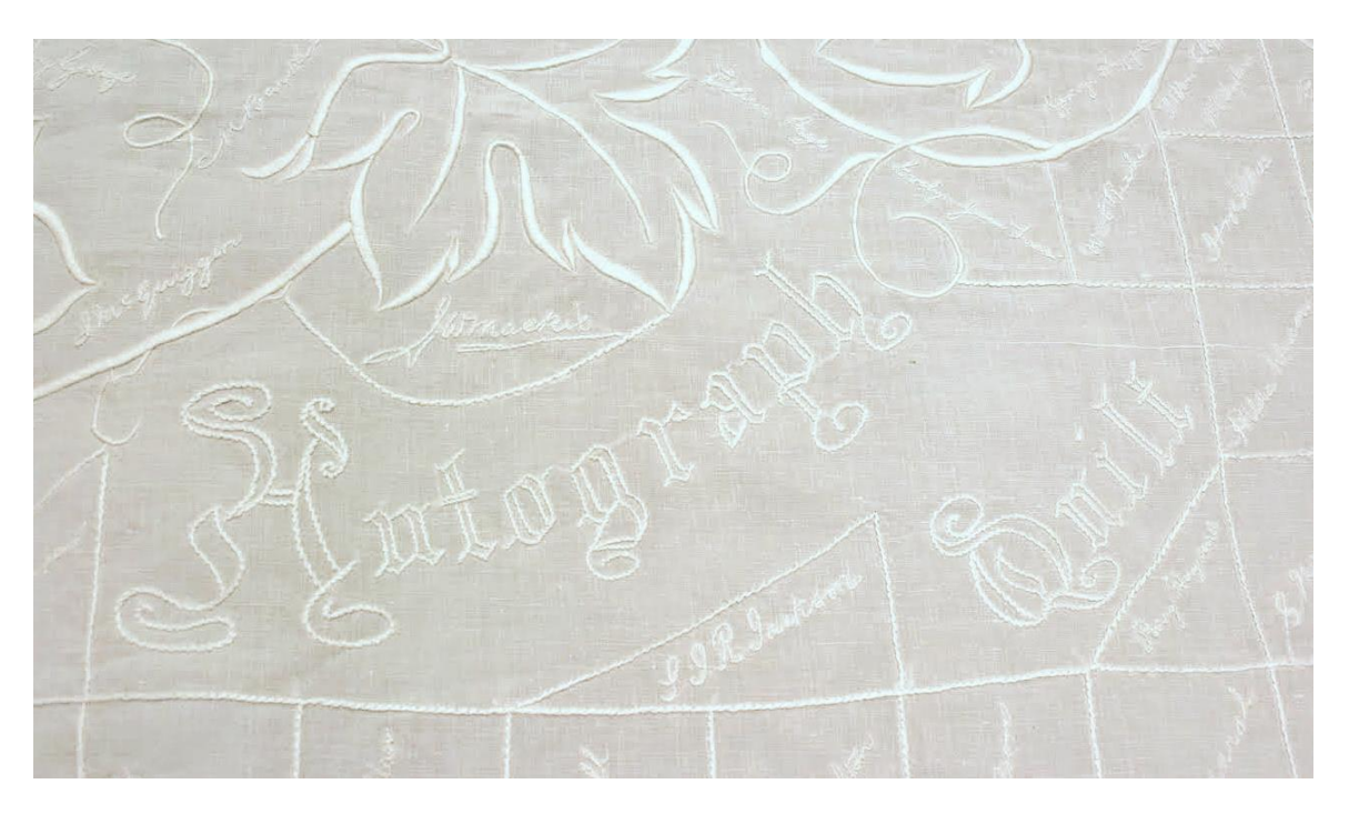
Rylstone Autograph Quilt (detail)